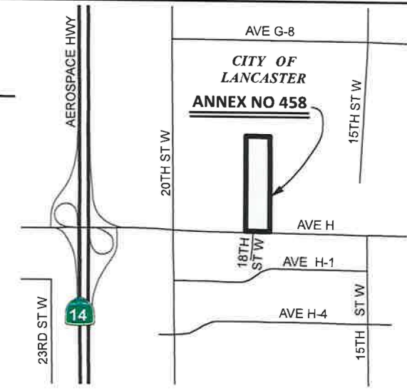
VICINITY MAP NO SCALE