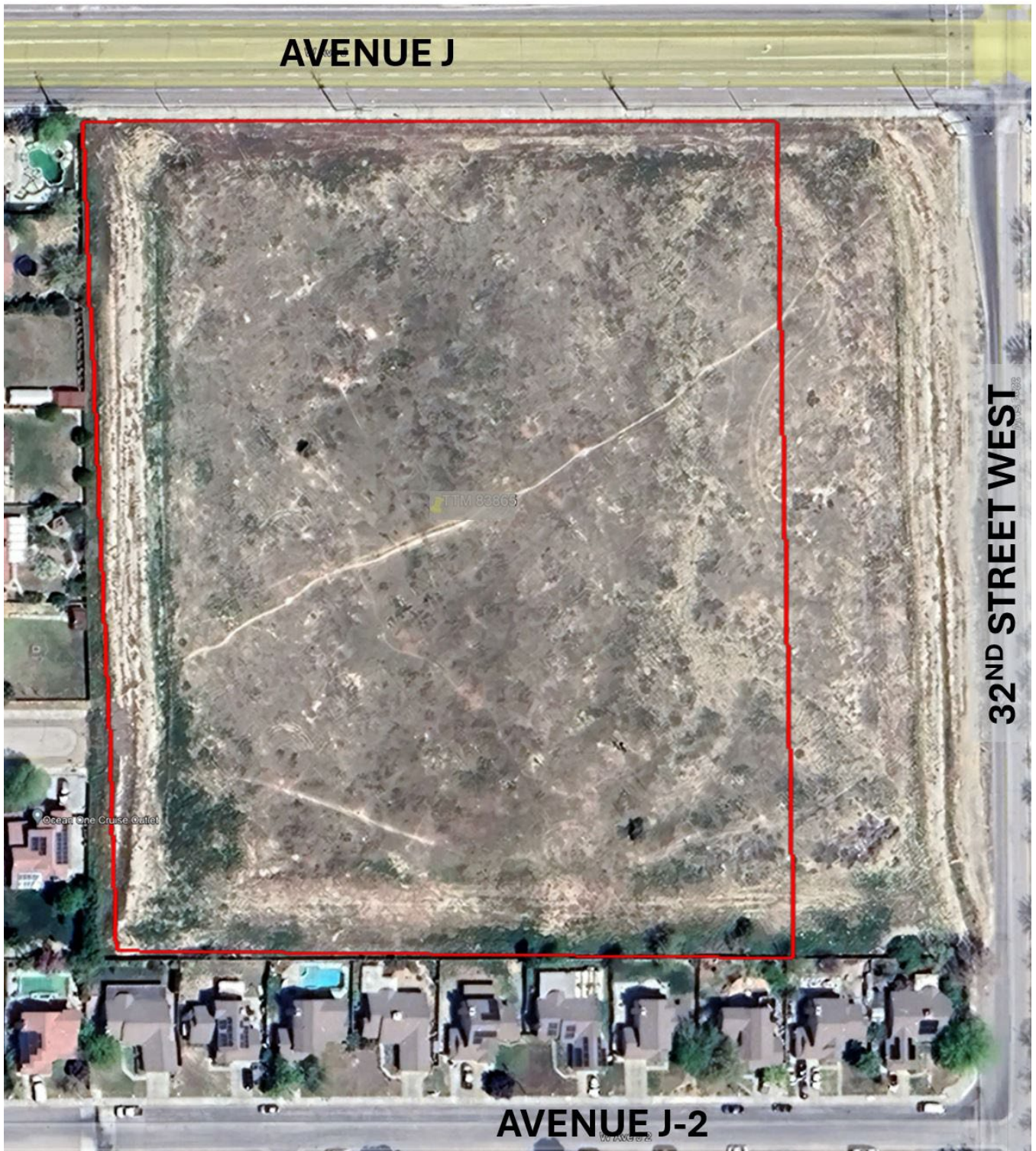
Figure 1, Project Location Map