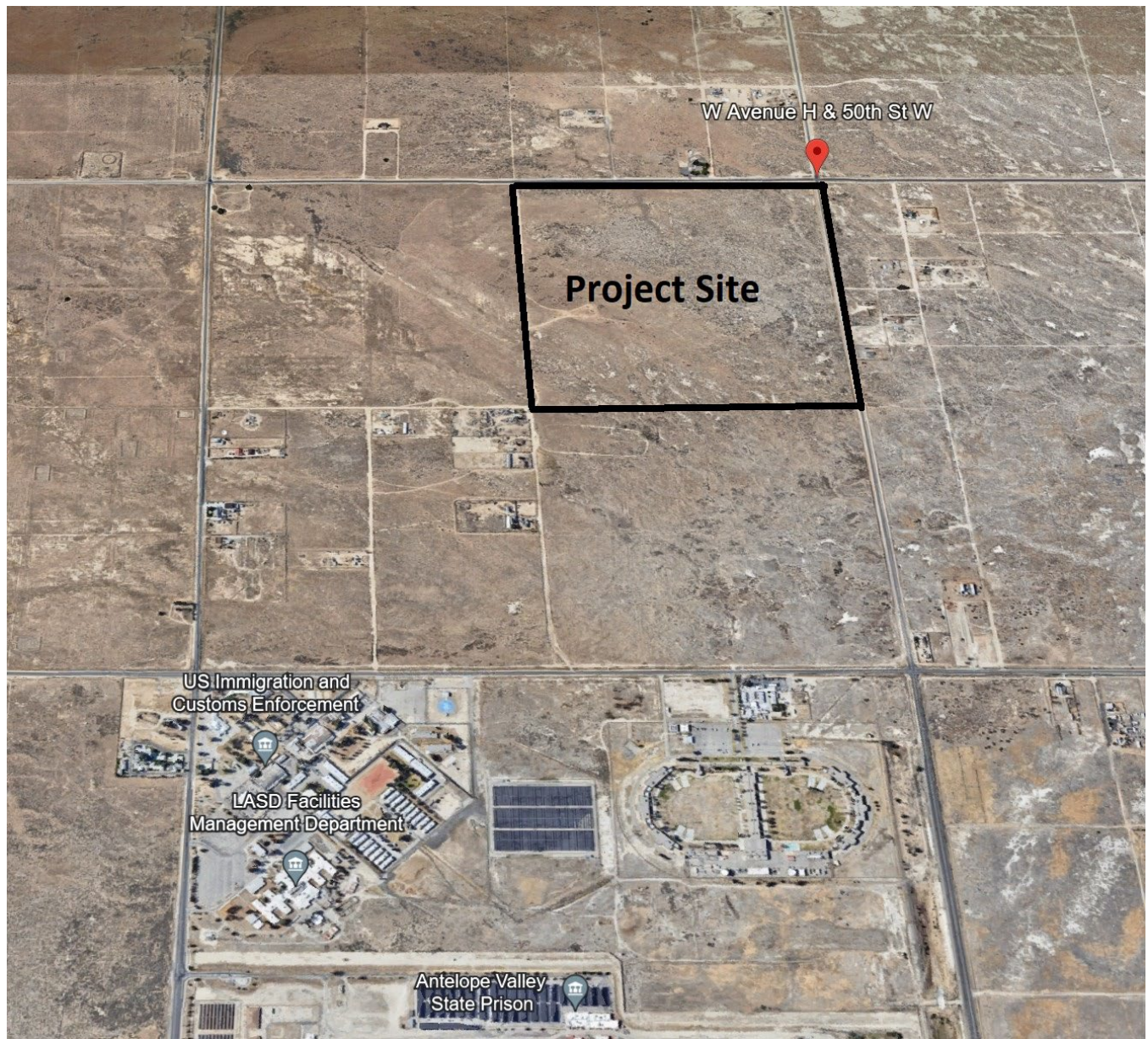
Figure 1, Project Location Map