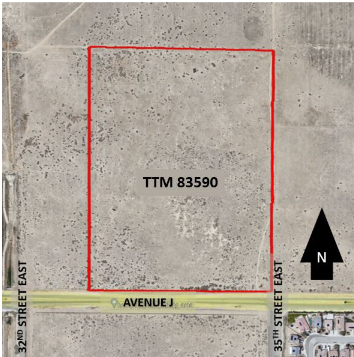
Figure 1, Project Location Map