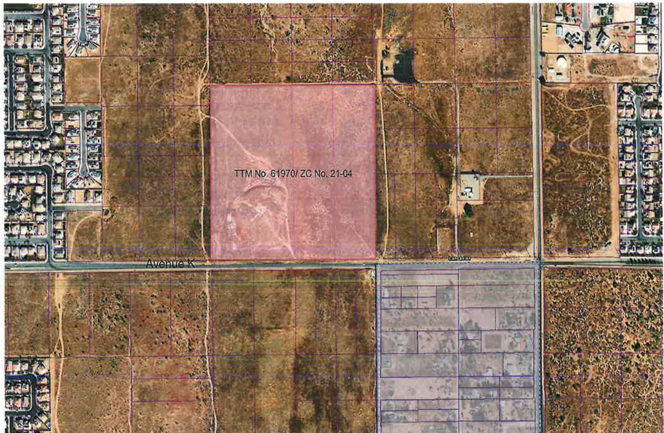
Figure 1, Project Location Map