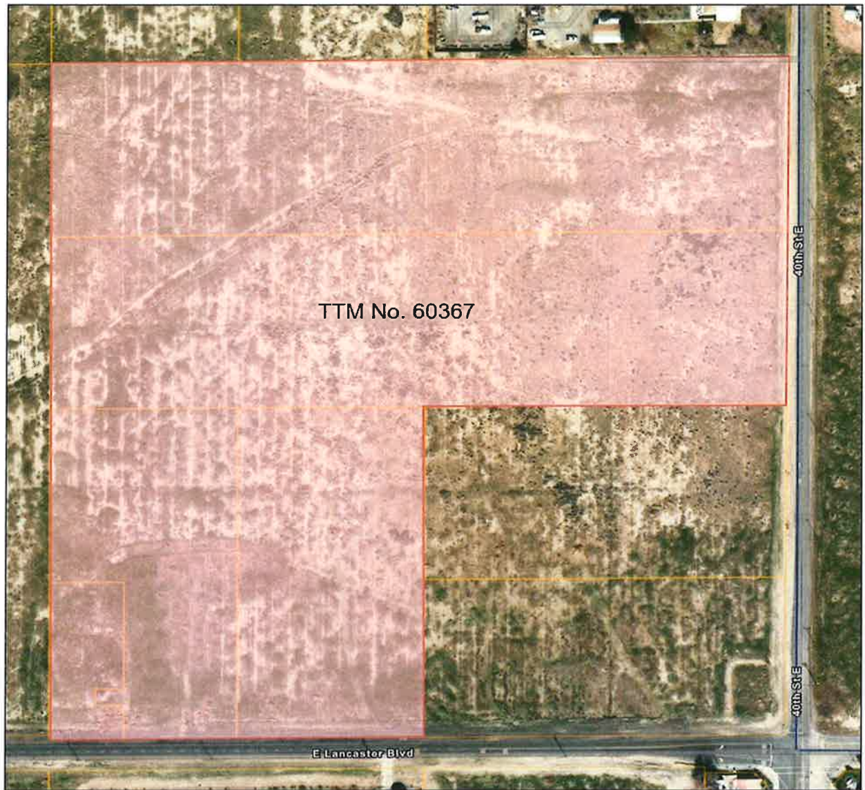
Figure 1, Project Location Map